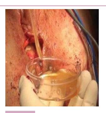
Figure 9 PRP gel interposizion.