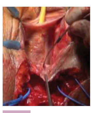
Figure 3 Rectovaginal fistula.

perineoplasty) and potentially failure of the repair we used, successfully, in both cases autologus Platelet Rich Plasma gel (PRP), recognized for its ability to promote wound healing and soft tissue sealing. Furthermore, PRP enhance the hemostatic response to injury and because of the high leukocyte concentration provides an antimicrobical effect [10]. Thus, once performing the plication of puborectalis muscle, the interposition of PRP gel fills dead spaces created by dissection and eliminates the possibility of fluid collections which may lead to failure. This consolidates the reconstruction of perineal body and supports the sphincteroplasty and we believe it is an important technical point in surgical treatment of traumatic cloaca.