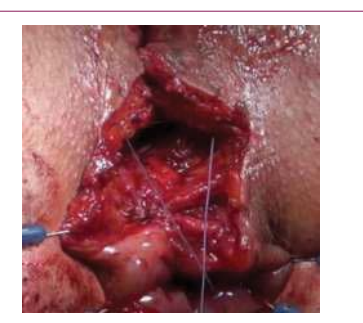
Figure 8 Bulbospongious muscle repair.